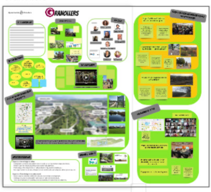
figure 3: Virtual city posters in Miro