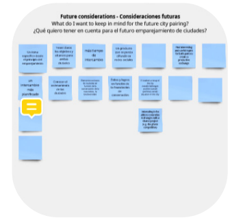
figure 4: Retrospective on Miro Board