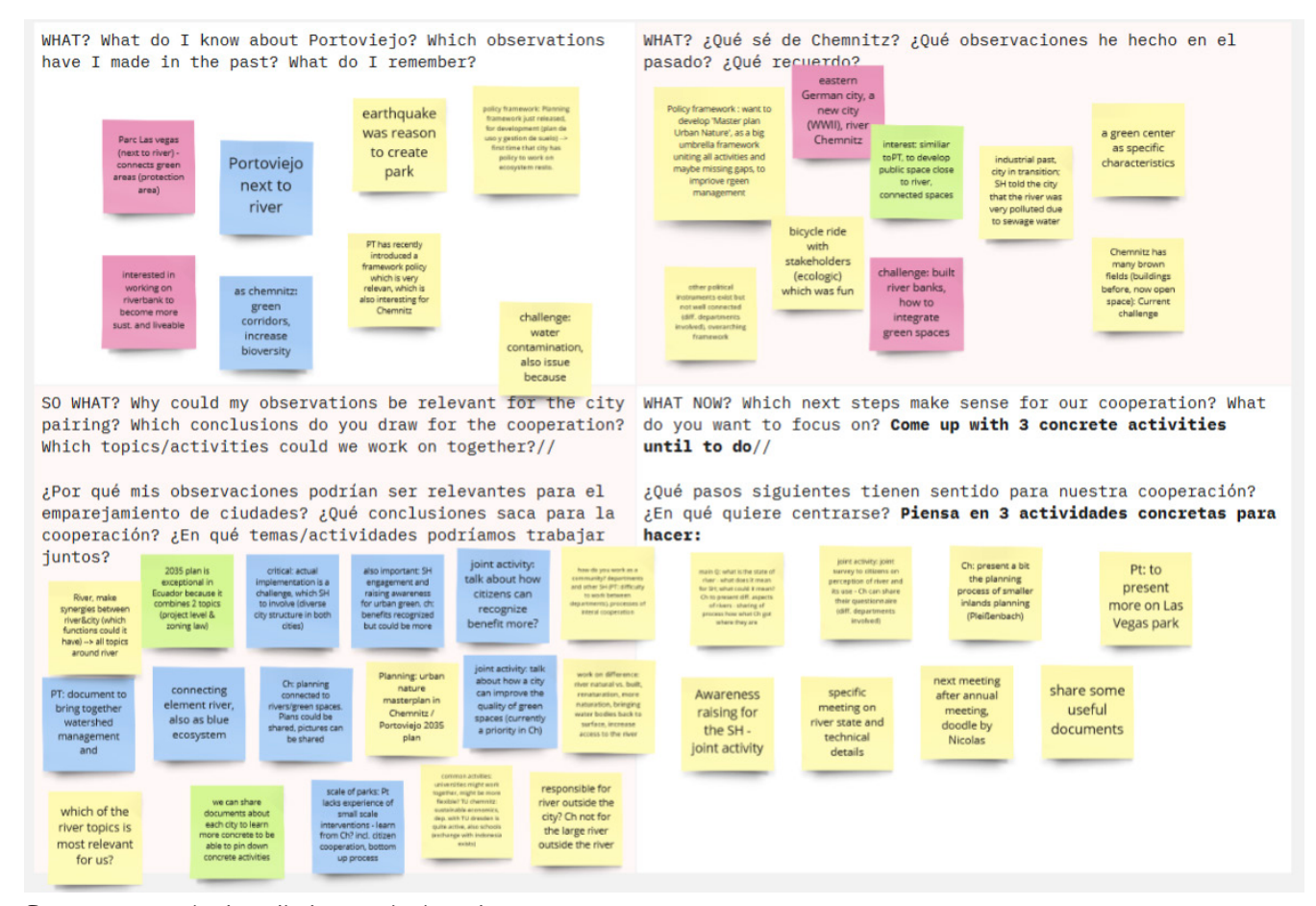
figure 2: W<sup>3</sup> method applied on a Miro board

NOW WHAT: In the third and final step, the topics are narrowed down to concrete action points and prioritized. The working agenda for the city pair is set for the next meetings and organizational issues like meeting times etc. are clarified.